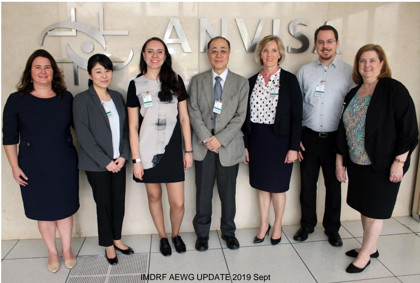
IMDRF AEWG UPDATE 2019 Sept